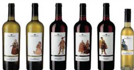
ESTERHÁZY Single Cru